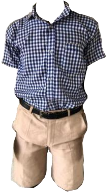
BLUE CHECK (BIG PATTERN) WITH KHAKI SHORTS