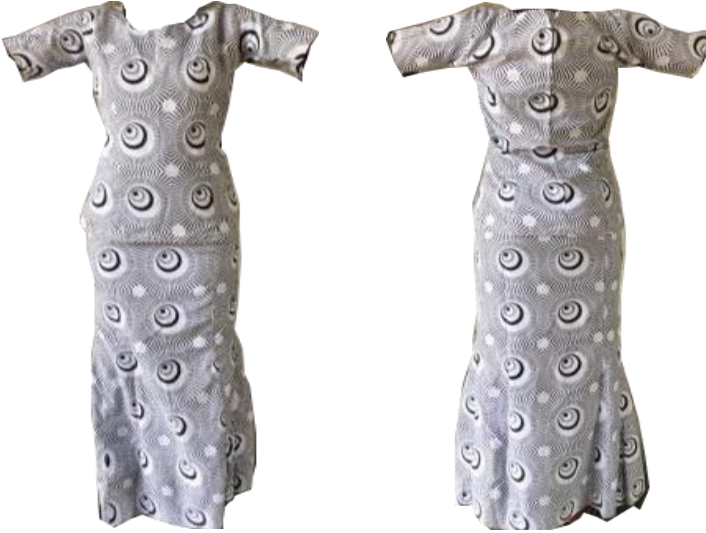
ANY BLACK AND WHITE DESIGNED CLOTH FRONT AND BACK