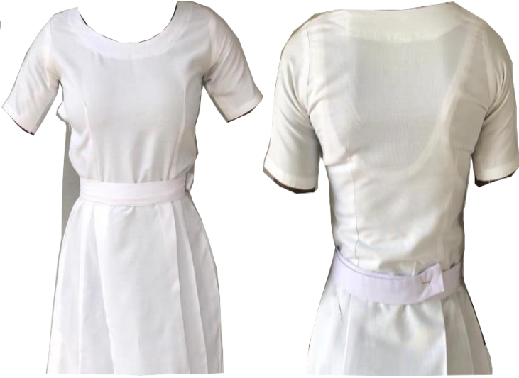
WHITE FROCK FRONT AND BACK