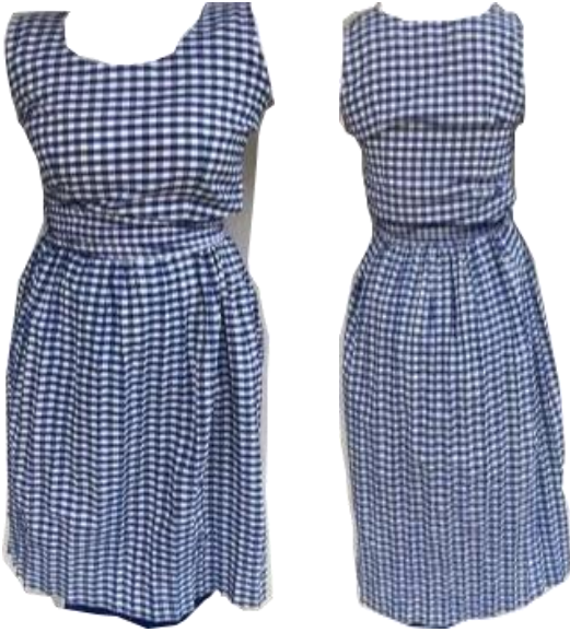
BLUE CHECK (BIG PATTERN) FRONT AND BACK